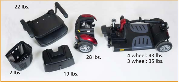
Disassembles into 5 pieces!