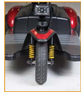
Comfort Spring System