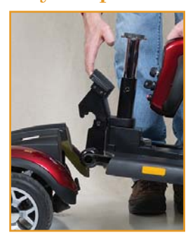
Step 4: Pull forward on the drivetrain release lever to separate the front and rear frame sections!

Step 3: Fold down tiller and lock in place!